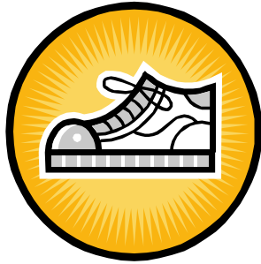
Fabulous Sneakers Store (1, 1)

You and your friends are spending Saturday morning at the new shopping mall. You do not want to waste time looking for the stores, so you go to the mall's directory which gives a map and coordinates for the stores you wish to visit. You think the coordinates for the stores are incorrect. Justify your thinking.