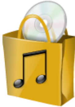
Upbeat Music Store (3, 2)